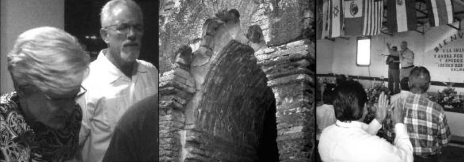
Prophetic prayer reveals ancient doors opening; pastors awaken to God's kairos moment for Mexico.