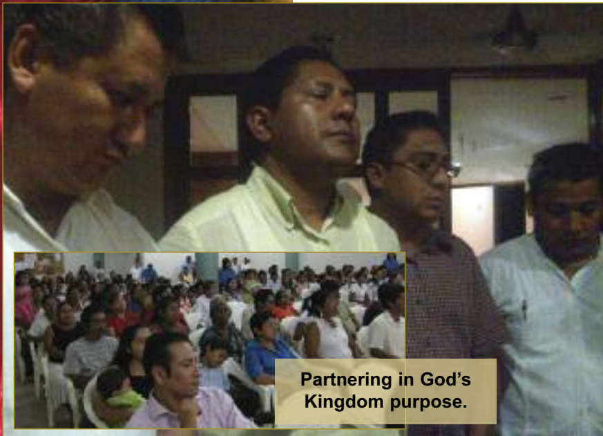
Partnering in God's Kingdom purpose.