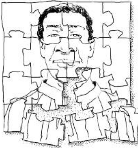
Discipling and building people.

Editor's Note: In the next issue of DIGEST, we will examine key principles that will help you to grasp the truth of this definition. The entire text of this teaching can be accessed on our website at www.world-map.com .